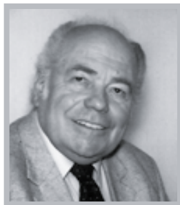
■ "Europe and its songs"